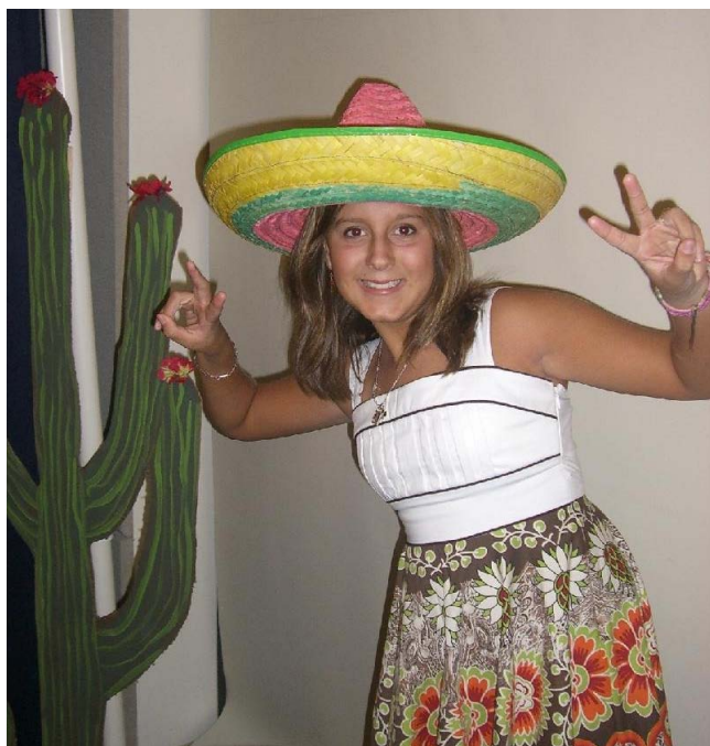
Special thanks to our junior